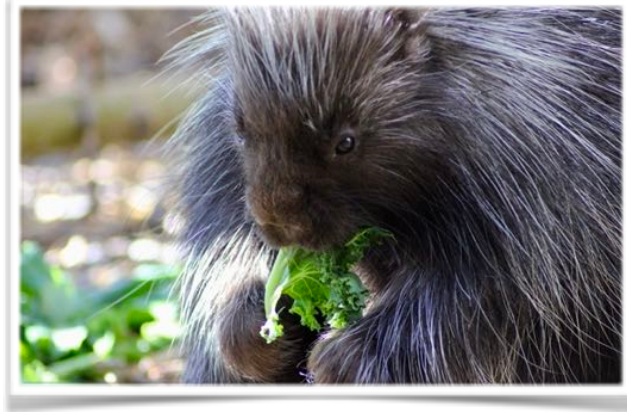
Porcupine „Quilliam“ at CWRS, 2019, AB

http://interiorwildlife.ca/ways-to-support-us/