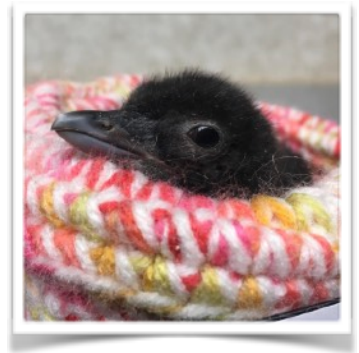
Loon chick, BC Wildlife Park Kamloops (2021)

If you are looking for an opportunity to promote your business by way of sponsorship, products, services, coupons, gift cards or a grand prize donation for this exceptional fundraiser, be sure to let us know! Our submission deadline: April 15th 2022.