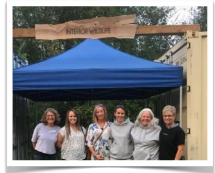
COF board visit

We will now be able to take in and house more cases than we were with 1 container and 1 RV. We can separate new patients according to provincial wildlife health guidelines into: our “Nursery Container” & our “Isolation Ward Container”. We do not have to euthanize suspicious “avian influenza” birds upon arrival or wait a 30 day biosecurity period.