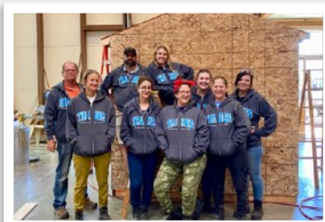
Women In Trades students 2022, of the OK College

To purchase items for us online, visit our amazon wish list!