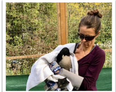
Canada goose before release

We've delivered another educational talk about our work and facility. We were invited by the Rotary Club of Summerland to speak about our mission and philosophy, one wild life at a time.