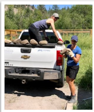
Great work - once again !